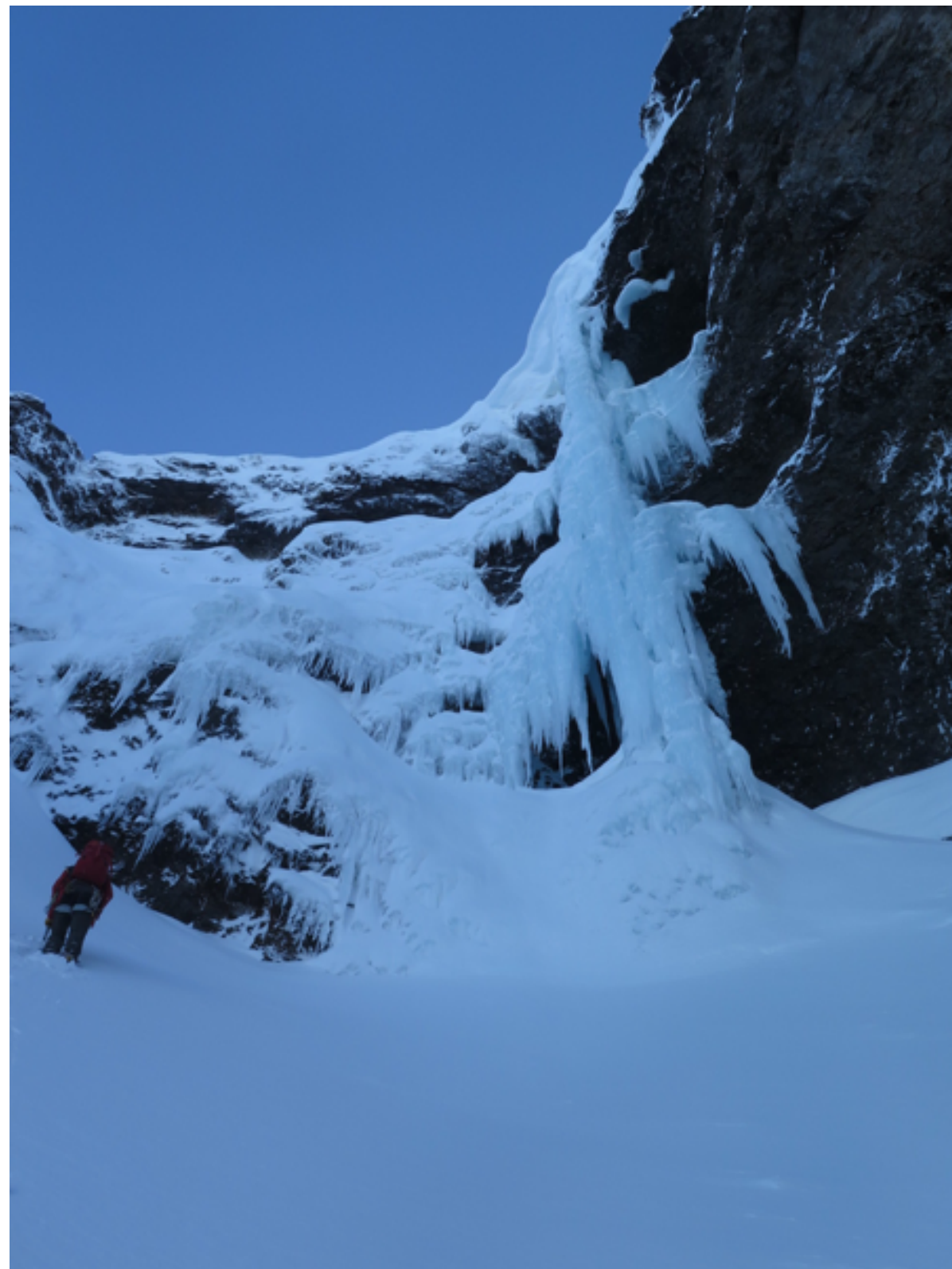
"Ekki er allt sem sýnist" one of the best lines of the crag

Conditions usually come in the second part of winter because the cliff is north facing and takes a bit of time to build up the ice, mostly for the Árdalsá & Innri-hvilt part and Bolaklettur. It's possible that the Brekkufjall sector gets in conditions earlier because there are more small streams on top of the mountain that freeze up easier. Sometimes a full week of cold is enough for it to be possible to climb in Brekkufjall. Due to the low elevation the climbs might be strongly affected by warm fronts and rain in winter, Brekkufjall in particular.